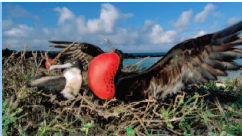
Watch for the unusual mating “dance” of the magnificent frigate birds, one of the Galápagos’ signature species.

On Santiago Island this afternoon, stroll along the glistening ebony sands of James Bay, where a wide variety of birds and wildlife peacefully commingle.