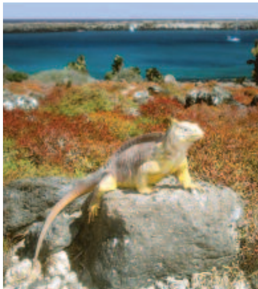
Observe, as Charles Darwin did more than 150 years ago, creatures indigenous to the Galápagos Islands, like this land iguana.