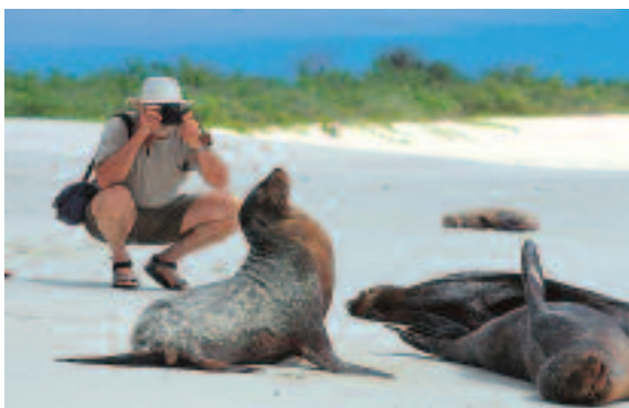
Take photographs of a lifetime in the Galápagos, where wildlife allows humans to approach it up-close, unlike anywhere else on earth.